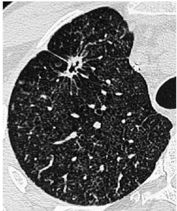
FIG. 3. Lung CT scan on day 156 after start of the first chemotherapy course, showing stable residual postoperative changes in the upper right lobe, where wedge resection had been performed.

Only 10 cases of A. ustus infection have been reported in the literature (23, 5, 14). Of the 10 patients, only 2 survived the infection and 4 had IPA. In three cases of IPA (2, 11, 23) the underlying disease was leukemia, treated by hematopoietic stem cell transplantation. Predisposing factors in the fourth case were diabetes, renal failure, and cardiac surgery (25). Of the patients with IPA, one was diagnosed postmortem, three had received antifungal therapy, and none survived the fungal infection. None of them had undergone lung resection. We and others have previously shown that early lung resection (lobectomy or wedge resection) combined with antifungal therapy is safe, effective, and diagnostic in neutropenic patients suspected of having IPA (1, 6, 7, 8, 16, 18, 26). A positive fungal culture allows for exact microbiological determination of the fungal species and for susceptibility testing. The significance of susceptibility testing is still debated, and results require careful interpretation. Lung resection in patients with IPA may decrease the fungal load and may reduce secondary dissemination. Furthermore, because IPA is angioinvasive and most of